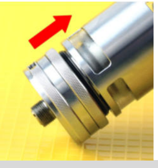
First, unscrew the top cap from the tank.