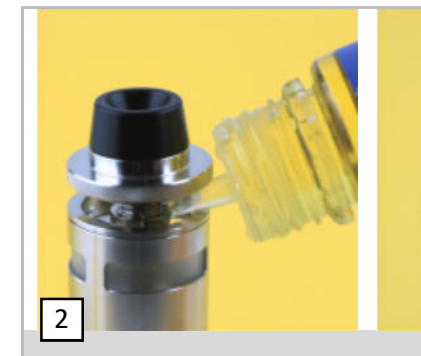
To fill, unscrew the top cap partially or completely.