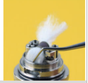
Now pull the cotton through the coil and push the cotton ends into the pockets.