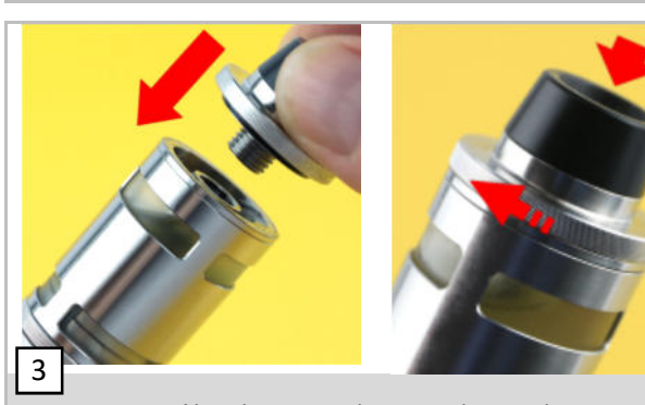
Now the top cap is screwed on again.