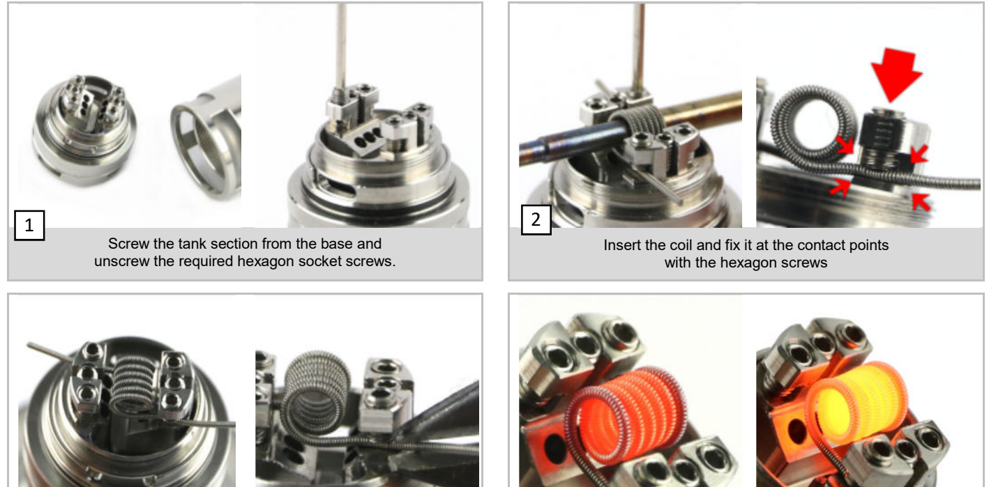
Let the coil light up slightly (uniform glow pattern)