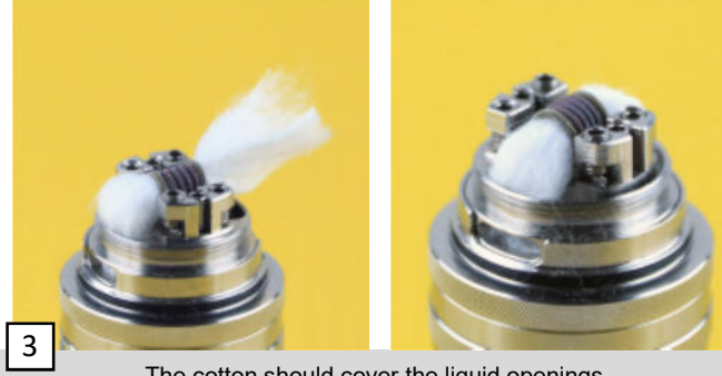
The cotton should cover the liquid openings well from the inside.