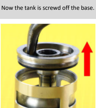
... unscrew it.