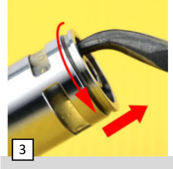
Grab the upper tank cap and ..