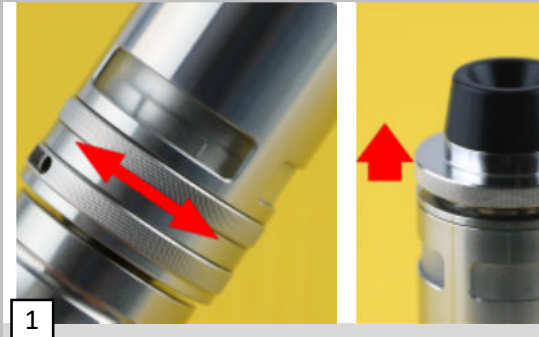
Before you fill the tank, the liquidcontrol should be closed (liquid holes covered).